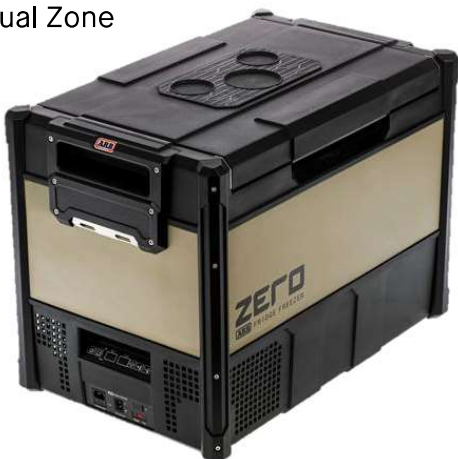
69L Dual Zone