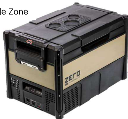
60L Single Zone