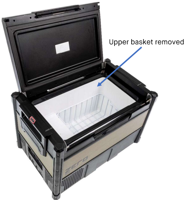
Removable upper basket with built-in folding access door